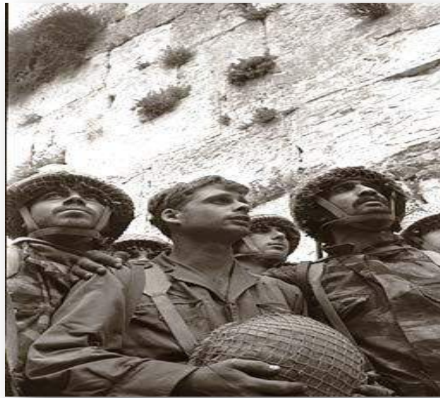
David Rubinger's famed photograph of IDF paratroopers at Jerusalem Western Wall shortly after its capture.

This year Yom HaAtzmaut (Israeli independence Day) is on Tuesday, May 2 nd . This year marks the 50 th Anniversary of the Six Day War, which occurred in June of 1967. It resulted with Israel acquiring the West Bank as well as East Jerusalem from the Jordanians and the Golan Heights from Syria.